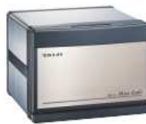
HC-6 (SUS) Stainless steel