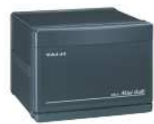
HC-6 (K) Black