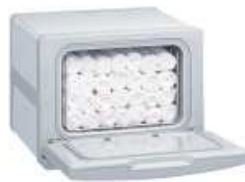
HC-6 (W) White